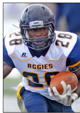
NC A&T Sports Photo