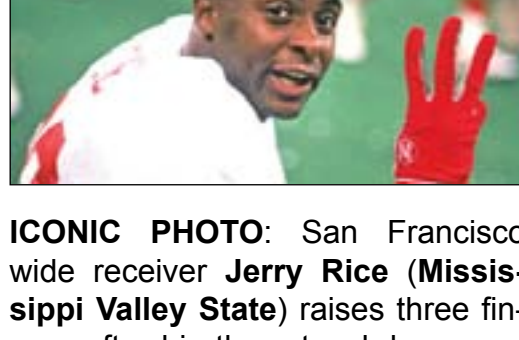
ICONIC PHOTO: San Francisco wide receiver Jerry Rice (Mississippi Valley State) raises three fingers after his three touchdown performance in Super Bowl XXIV.

STORYLINE: San Francisco added to its Lombardi Trophy collection going back-to-back in Super Bowls XXIII and XXIV, winning this one in a 55-10 shellacking of Denver at the New Orleans Superdome. Once again, wide receiver Jerry Rice (Mississippi Valley State) had an outstanding game, catching seven (7) passes for 148 yards and touchdown receptions of 20, 38 and 28 yards and could have easily repeated as the MVP. Super Bowl XXIII hero John Taylor (Delaware State) also caught a touchdown pass, giving the black college duo (Rice and Taylor) four of the five touchdown passes thrown by SF quarterback Joe Montana.