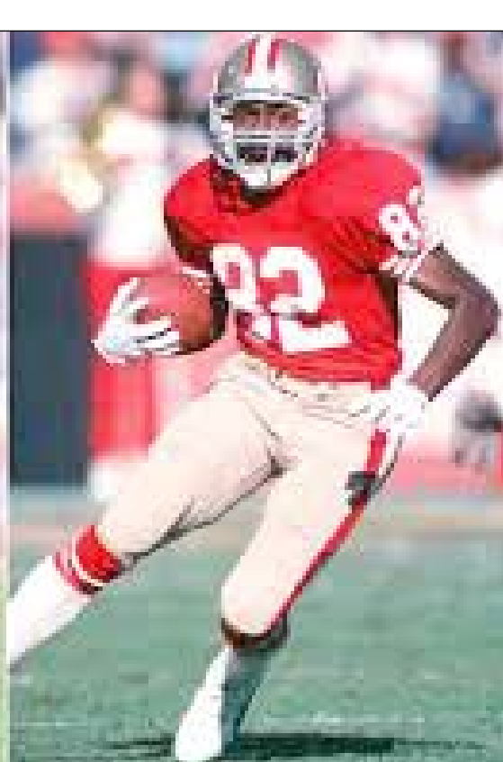
DYNAMIC DUO: San Francisco wide receivers Jerry Rice (#80, Mississippi Valley State) and John Taylor (#82, Delaware State) combined for 10 catches and four touchdowns in Super Bowl XXIV.