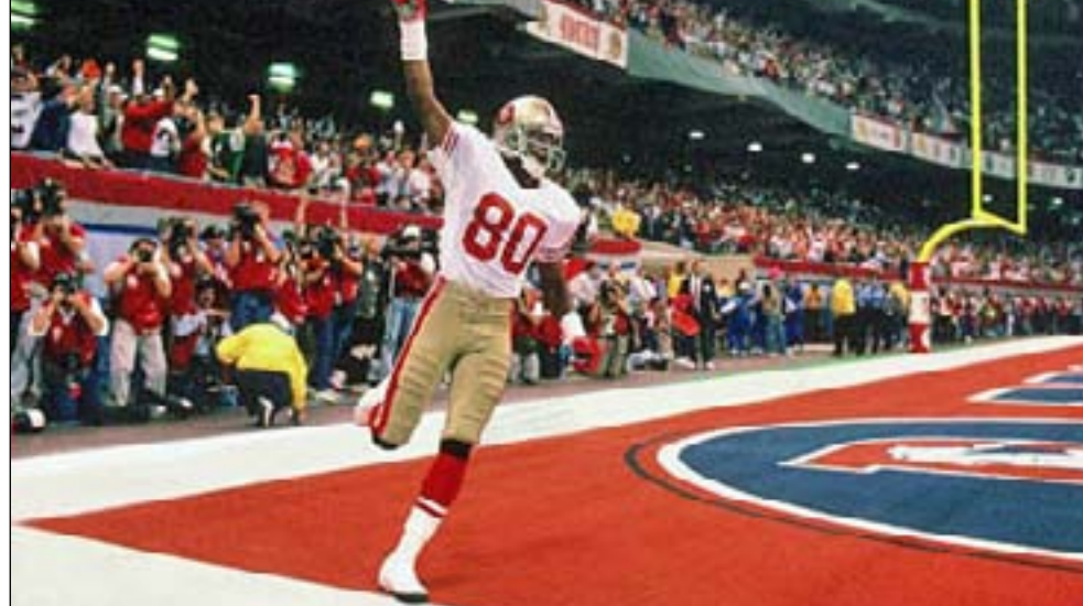
San Francisco wide receiver Jerry Rice (#80, Mississippi Valley State) celebrates after scoring one of his three touchdowns in Super Bowl XXIV.