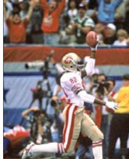
TO THE HOUSE: San Francisco wide receiver John Taylor (#82, Delaware State) hauls in 35-yard touchdown pass from Joe Montana in third quarter of Super Bowl XXIV.